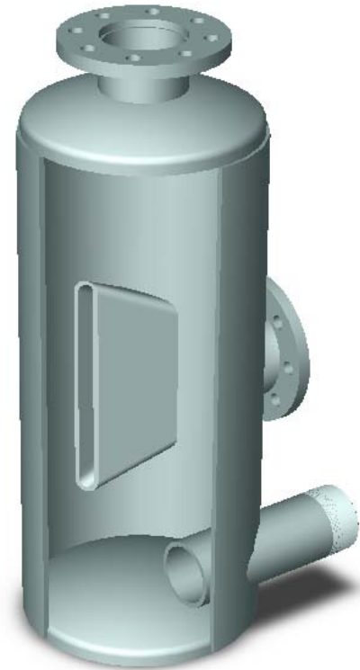
Figure 1.0 Burgess-Manning model WSS water separator.